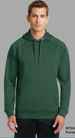
ST250 Forest Green