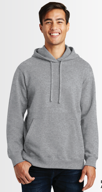
PC850H Athletic Heather