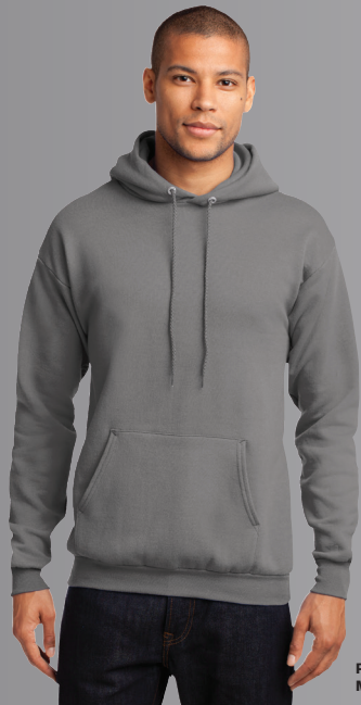
PC78H Medium Grey