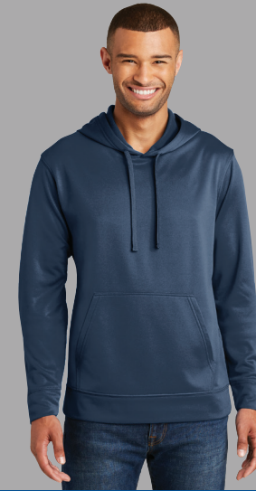
PC590H Deep Navy