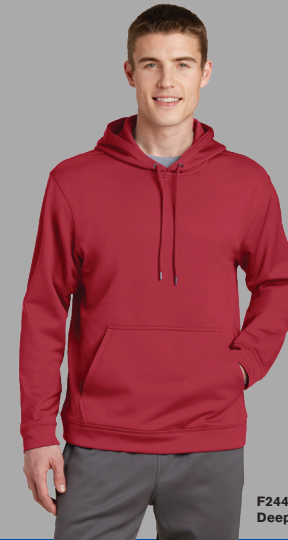
F244 Deep Red