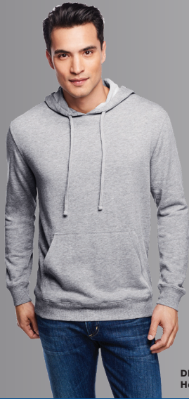
DM391 Heather Grey