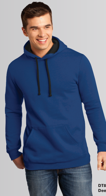
DT810 Deep Royal