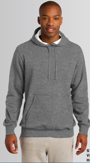
ST254 Vintage Heather